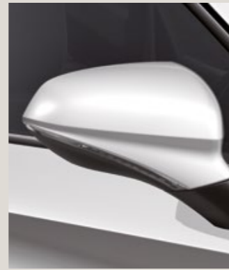
CANDY WHITE 1