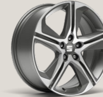
PERFORMANCE 18" 30/9 COSMO GREY MACHINED ALLOY WHEELS 2 FR