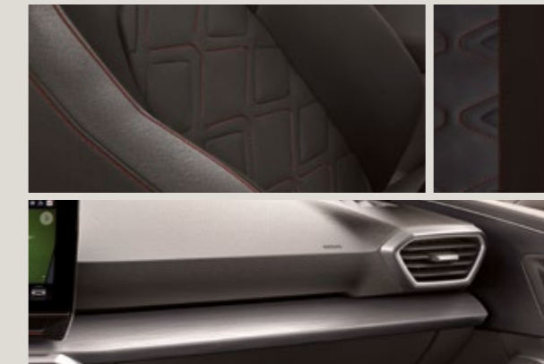
LEATHER BLACK SPORT SEATS