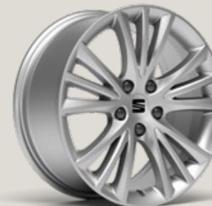
DYNAMIC 17" 30/3 BRILLIANT SILVER ALLOY WHEELS 1 St