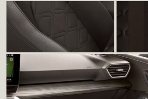
LEATHER BLACK SPORT SEATS