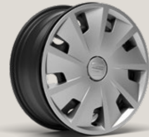
URBAN 15" STEEL WHEELS R