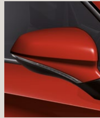
PURE RED 1