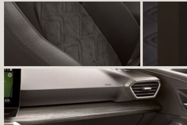
DINAMICA® SPORT SEATS