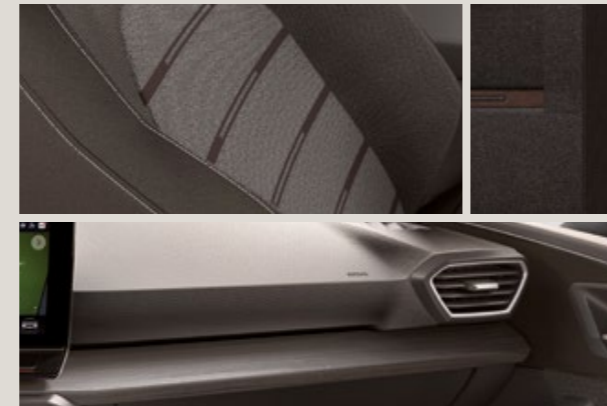
CLOTH COMFORT SEATS