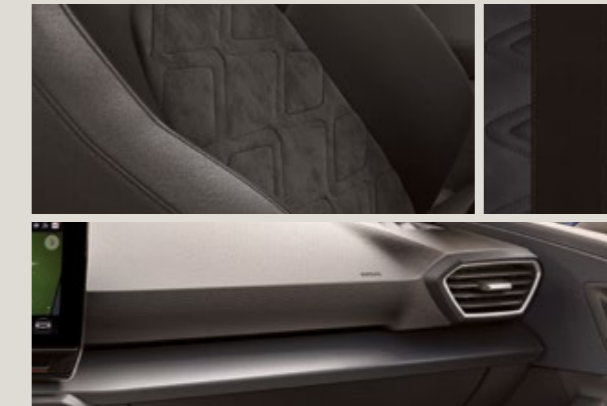
DINAMICA® SPORT SEATS