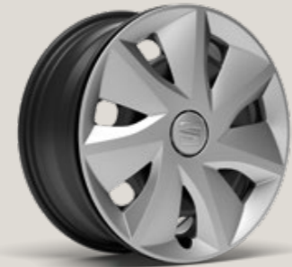
URBAN 16" 30/1 STEEL WHEELS R