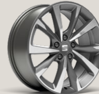
PERFORMANCE 18" 30/6 COSMO GREY MACHINED ALLOY WHEELS 2 FR