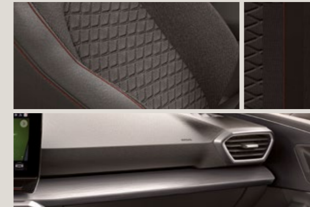
CLOTH COMFORT SEATS