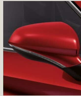
DESIRE RED 2