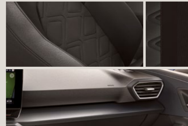
LEATHER BLACK SPORT SEATS