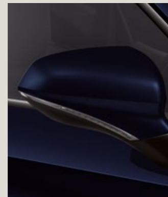
ASPHALT BLUE 2