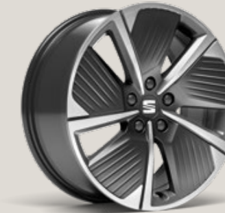
PERFORMANCE 18" 30/10 NUCLEAR GREY MACHINED AERO WHEELS 2 XC