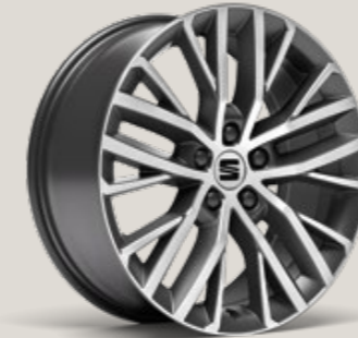
PERFORMANCE 18" 30/4 NUCLEAR GREY MACHINED ALLOY WHEELS 2 XC