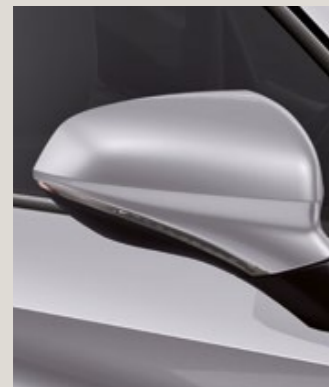
URBAN SILVER 2