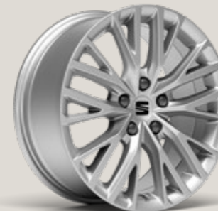
DYNAMIC 17" BRILLIANT SILVER ALLOY WHEELS XC