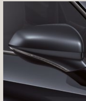
MAGNETIC TECH 2