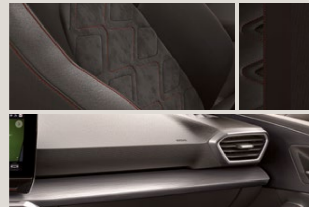
DINAMICA® SPORT SEATS