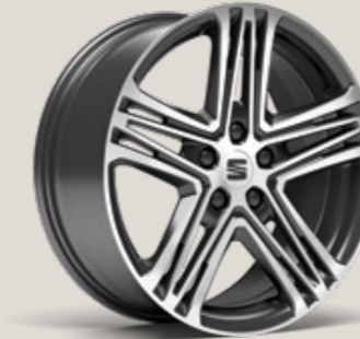
PERFORMANCE 18" 30/8 NUCLEAR GREY MACHINED ALLOY WHEELS 2 XC