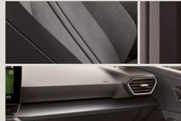
CLOTH COMFORT SEATS