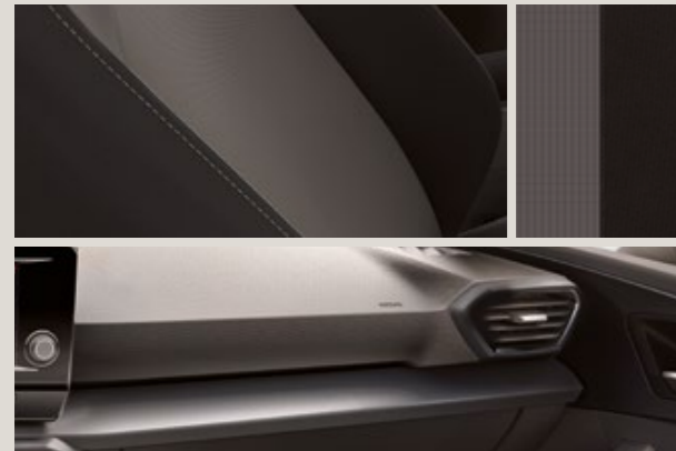
CLOTH COMFORT SEATS