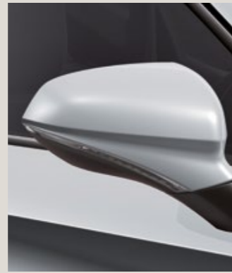
NEVADA WHITE 2