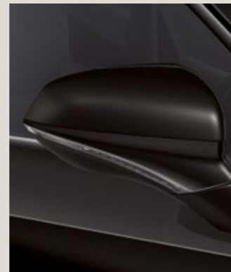
MIDNIGHT BLACK 2