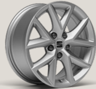
DESIGN 16" 30/2 BRILLIANT SILVER ALLOY WHEELS R St