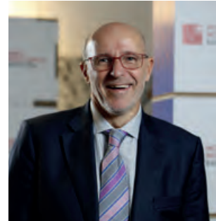
Carlos Grau CEO of Mobile World Capital Barcelona

At SEAT, you consider the car to be the second digital platform, after the mobile phone. Could you describe what services the car of the future will offer users?