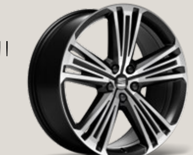
SUPREME 20" 37/2 SPORT BLACK MATTE MACHINED ALLOY WHEELS