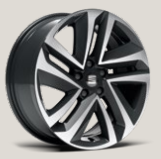
PERFORMANCE 18" 37/1 BLACK MACHINED ALLOY WHEELS