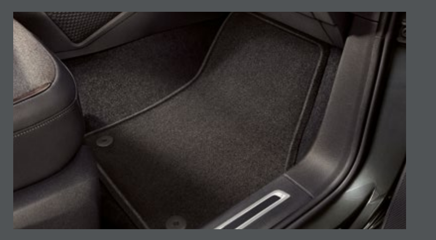
Velpic® floor mats.

Big plans? The Boot Tray with high walls and stainlesssteel moulding protect your SEAT Tarraco during loading and unloading.