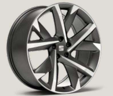
SUPREME 20" 37/3 COSMO GREY MACHINED ALLOY WHEELS