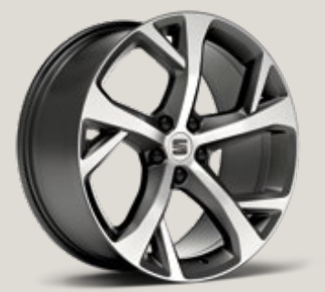
EXCLUSIVE 19" COSMO GREY MACHINED ALLOY WHEELS