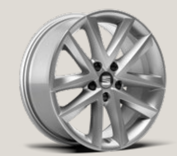
DYNAMIC 17" BRILLIANT SILVER ALLOY WHEELS 51