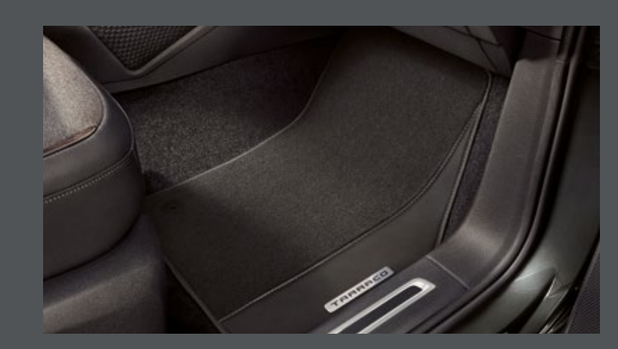
Classic Grey floor mats.

Take on the road in comfort with thick Velpic® mats featuring a non-slip rubber backing.