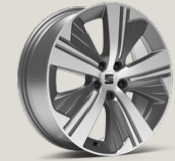
EXCLUSIVE 19" NUCLEAR GREY MACHINED AERO WHEELS